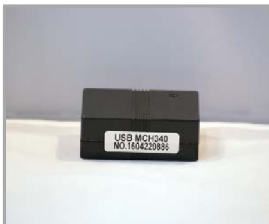
USB BLACK BOX (64 USER) $10.00