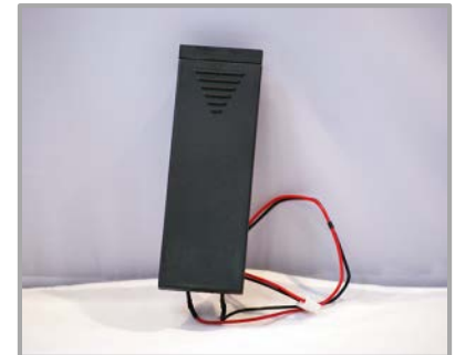
BATTERY PACK (OLD STYLE) $6.00

Tax and shipping not included All pricing in USD and valid until 12/31/2018 www.safemark.com