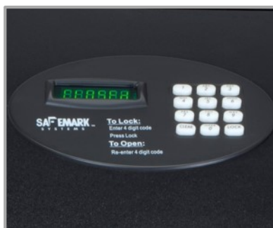
KEYPAD 5.4 BLACK $45.00