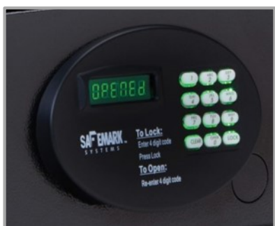
KEYPAD 5.3 BLACK $45.00