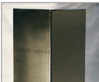
13.5" PEDESTAL BLACK $10.00