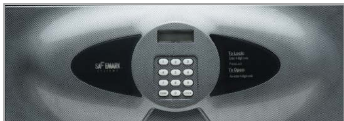
FACE PLATE SILVER HOLES (wings not included) $50.00 (specify STX or LTX on order)

Tax and shipping not included All pricing in USD and valid until 12/31/2018 www.safemark.com