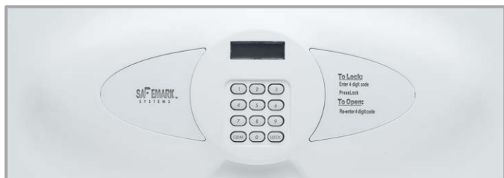
FACE PLATE BRILLIANT WHITE (wings not included) $50.00 (specify STX or LTX on order)