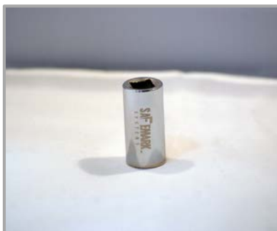
TRI-GROOVE NUT DRIVER $26.00