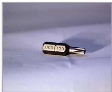
T20 TORX BIT $6.00