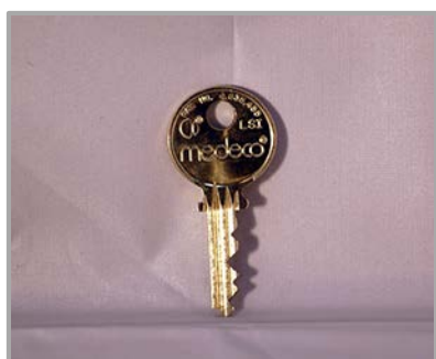
MEDECO MASTER KEY $12.95