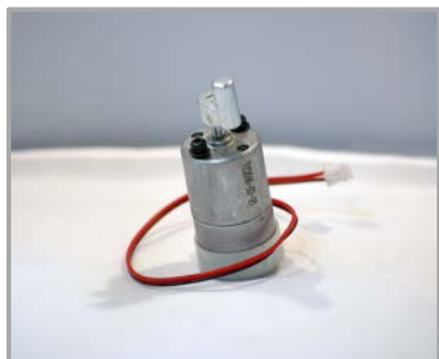
SAFE MOTOR $10.00