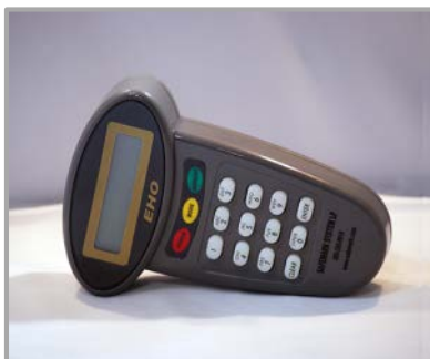
EHO 64 USER $395.00 (software required)