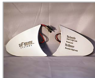
STX/LTX WINGS BRILLIANT WHITE (color as shown on Face Plate) $30.00 (pair)