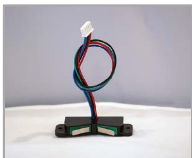
MICROSWITCH BLACK RIGHT HINGE $6.95