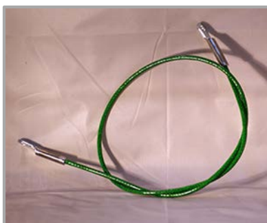
GREEN CABLE $12.00