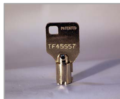
COBRA KEY $12.95