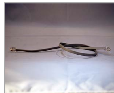
EHO CORD $6.00