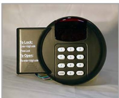
KEYPAD 4.0 BLACK $45.00