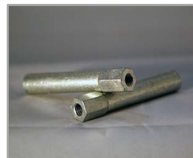
DRAWER POST $3.00 (set)

Tax and shipping not included All pricing in USD and valid until 12/31/2018 www.safemark.com