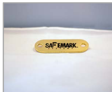
COVER PLATE GOLD $6.00