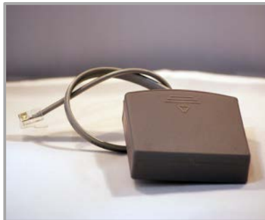
EXTERNAL BATTERY PACK $30.00