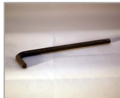
HEX WRENCH $6.00