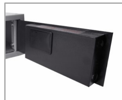
SAFE DOOR $115.00

Tax and shipping not included All pricing in USD and valid until 12/31/2018 www.safemark.com