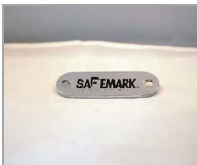
COVER PLATE SILVER $6.00