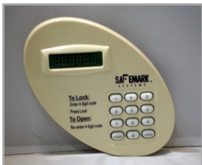
KEYPAD 5.0 BEIGE $45.00