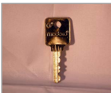
MEDECO USER KEY $12.95