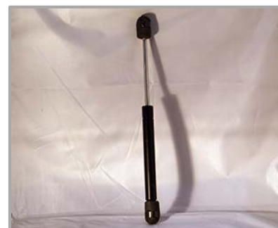
PISTON ARM $15.00