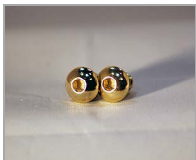
COVER SCREW GOLD $0.50 (set)