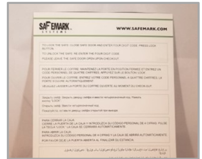
MULTI-LINGUAL INFO CARD $0.89