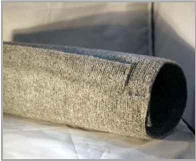
CARPET GREY $5.00