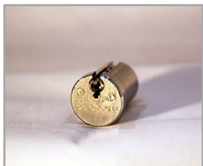
MEDECO LOCK $20.00