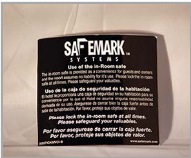
DISCLAIMER STICKER BLACK $1.25