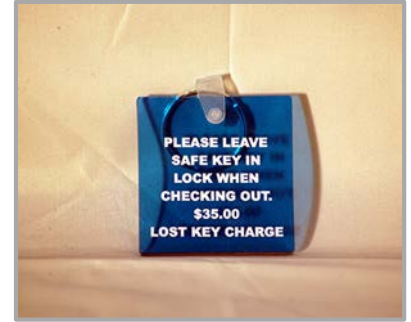
BLUE KEYTAG $0.50