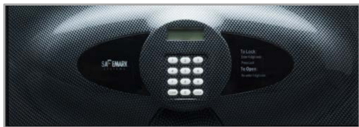
FACE PLATE BLACK SILVER CARBON (wings not included) $50.00 (specify STX or LTX on order)