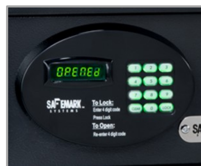
KEYPAD 5.1 BLACK $45.00