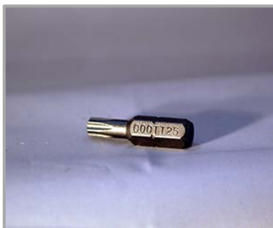
T25 TORX BIT $6.00