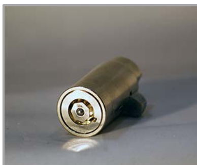
COBRA LOCK $20.00