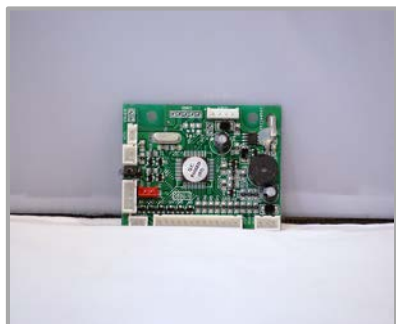
CIRCUIT BOARD (20/64 USER) $55.00