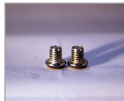
PAN SCREW LARGE $0.50 (set)

Tax and shipping not included All pricing in USD and valid until 12/31/2018 www.safemark.com