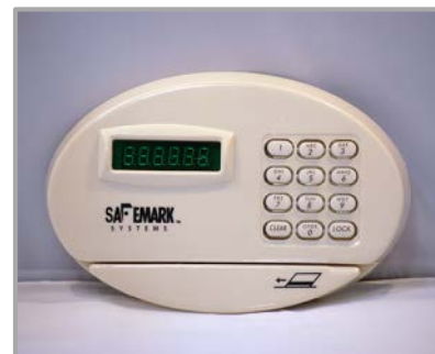
KEYPAD 5.2 BEIGE $45.00