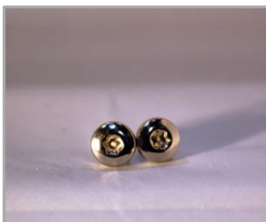
PAN SCREW SMALL $0.50 (set)