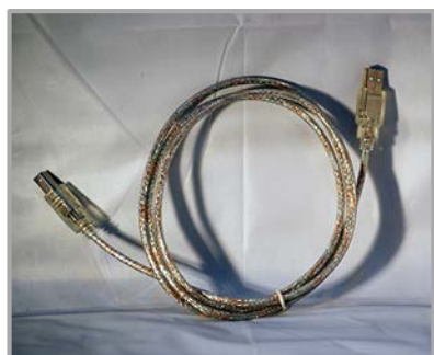
USB CABLE $10.00