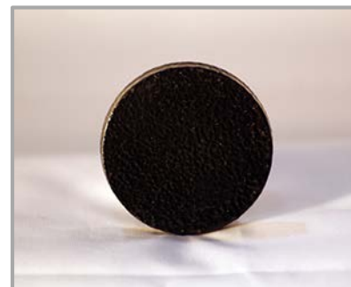
ROUND KEY COVER BLACK $6.00