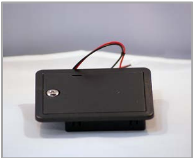
BATTERY CASE (20/64 USER) $6.00