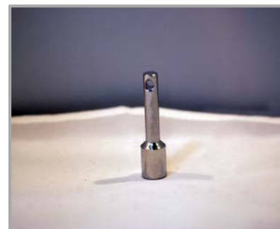
MAGNETIC STICK $6.00