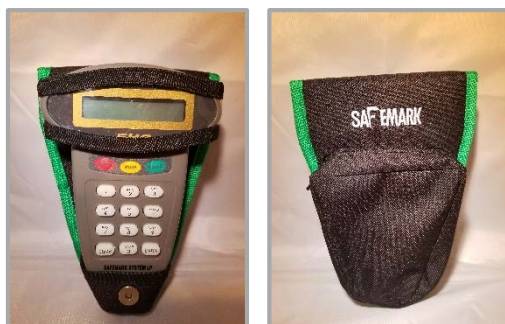
EHO Holster Front/Back (EHO not included) $35.00