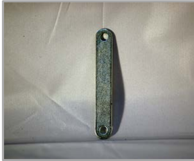
BLOCKER BAR $2.00