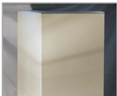
13.5" PEDESTAL BEIGE $10.00