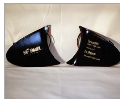
STX/LTX WINGS BLACK $30.00 (pair)