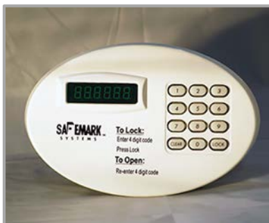
KEYPAD 5.1 BEIGE $45.00