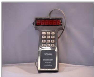
EHO 20 USER $395.00