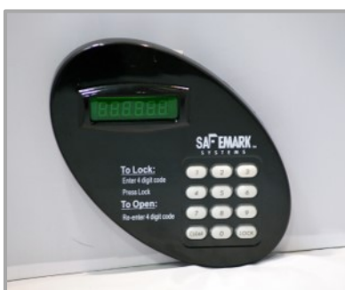
KEYPAD 5.0 BLACK $45.00