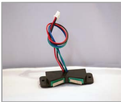
MICROSWITCH BLACK LEFT HINGE $6.95