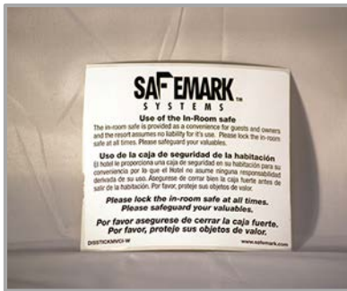
DISCLAIMER STICKER WHITE $1.25