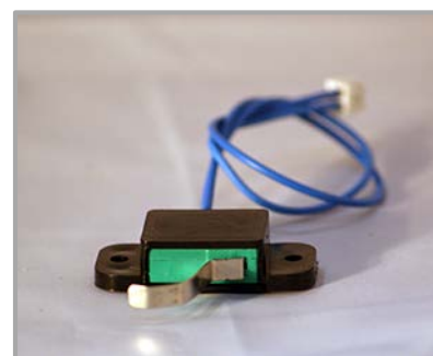
SINGLE MICROSWITCH $6.95