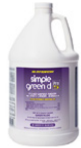
Simple Green d Pro 5 (EPA Registration Number 6836-140-56782)

Disinfecting using an EPA-registered product can be effective against the 2019 Novel Coronavirus; regular use offers a safer experience and reassures guests as our community deals with the impact of the current situation. Safemark is specifying the use of Simple Green d Pro 5 , which has demonstrated effectiveness and can be used as a disinfectant, fungicide and virucide. This product has shown no detrimental effects to Safemark equipment in Safemark tests. We have also identified a number of alternative disinfectant solutions if this product is unavailable. We recommend that wheelchairs be disinfected after each use.