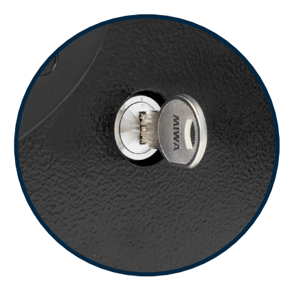
High Security Key Override

Concealed behind a plate, the cylinders are customized to each property with a unique pinning code. Unlike skeleton keys, the high security keys cannot be easily copied and additional keys are only available from the manufacturer with proper authority. The lock is virtually pick proof and cannot be bumped.