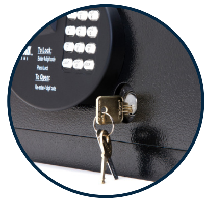
High Security Key Override

Concealed behind a plate, the cylinders are customized to each property with a unique pinning code. Unlike skeleton keys, the high security keys cannot be easily copied and additional keys are only available from the manufacturer with proper authority. The lock is virtually pick proof and cannot be bumped.