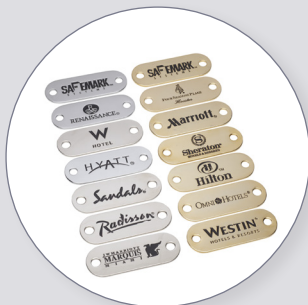
Custom Logo Plates (Available on Select Models)