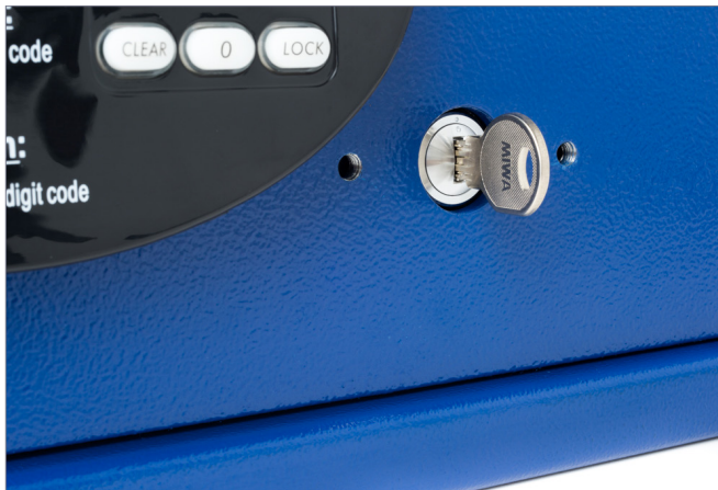
High Security Key Override*